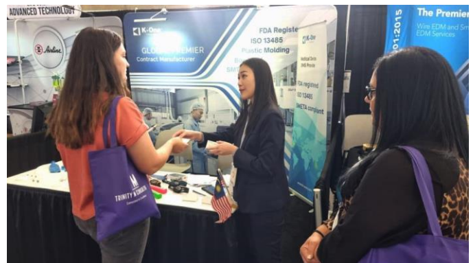
Curious customers from medical sector enquiring on K-One's manufacturing capabilities.

Looking ahead, K-One will continue to expand its footing in the medical/healthcare sector and EMS industry. K-One's team has lined up an exhibition roadmap to cover other major cities/areas such as the Silicon Valley and Anaheim in the US. There is definitely more excitement and potential business in the horizon. Let us give kudos to the K-One business development team!