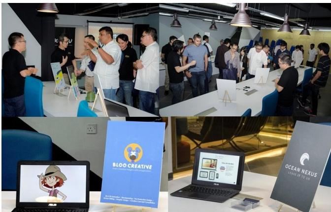
K-One and KiasuLab members' showcase at hot desk area

Another highlight of the event was K-One and KiasuLab members' showcase. It was a great opportunity to show technology products which were successfully launched to inspire emerging entrepreneurs and startups alike.