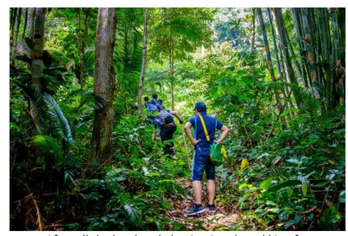
After all the hardwork, having jungle trekking fun