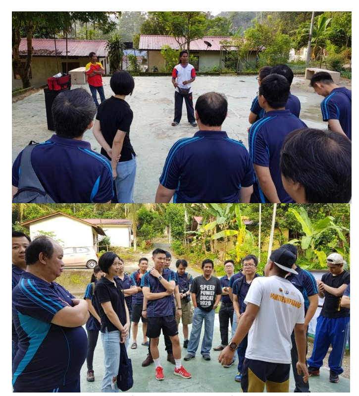
Top: Introductory briefing by President of Operations of Orang Asli Village.

Bottom: A member from MyCorps briefing on activities for the day.