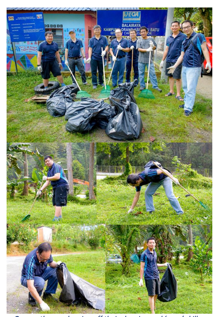
Our gentlemen showing off their cleaning and 'sapu' skills

Asli children were not left out but instead participated and found great fun in a coloring contest.