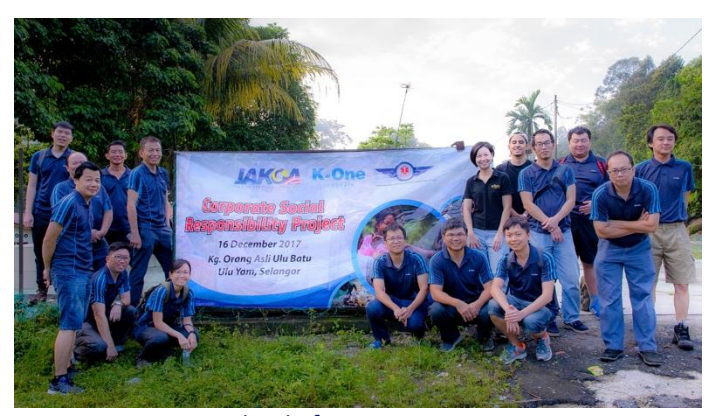
One shot before program starts

The programs' objective is to provide social services to the villagers and to prepare the children for the coming back-to-school session. It was also intended to give our staff a glimpse of how our indigenous communities live.