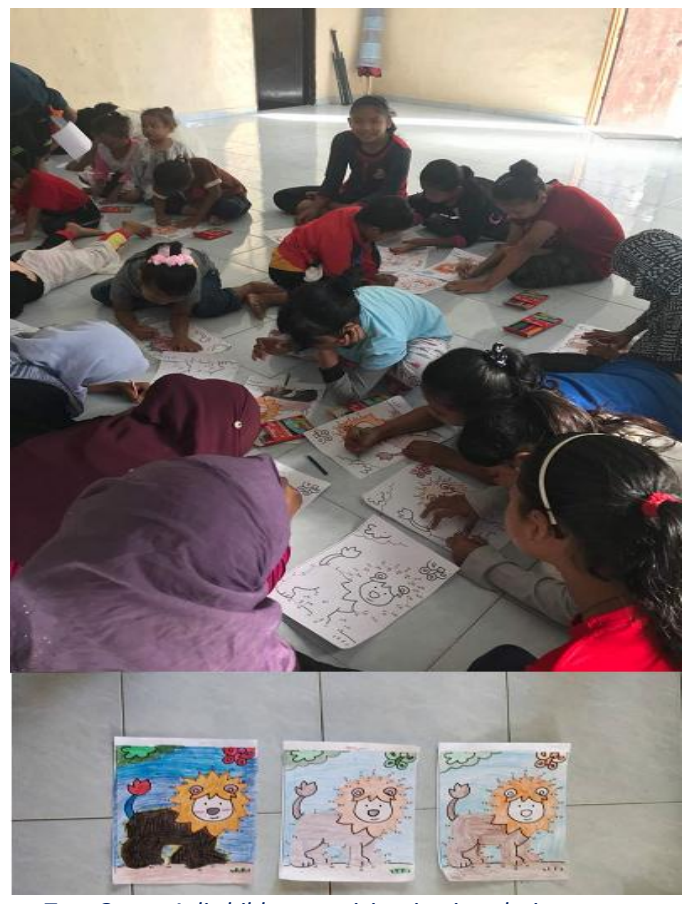
Top: Orang Asli children participating in coloring contest Bottom: 3 finalists selected from the contest

Upon completion of the CSR programs, participants tracked into the forest guided by the Orang Asli. All went home in good spirits and feeling proud of what they have achieved for the day in making other people happy.