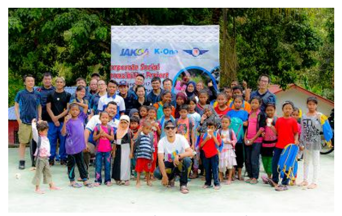
Another shot captured after distribution of school bag to Orang Asli children under back-to-school program