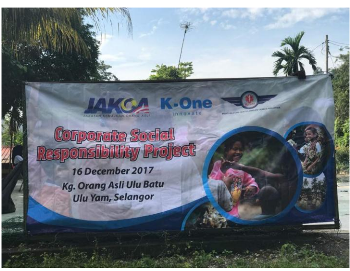
Combined team efforts of K-One/JAKOA/MyFAST/MyCorps

On 16 December 2017, K-One staff whizzed its way to the Orang Asli Village at Ulu Batu at the fringe of Selangor to join hands with the Department of Orang Asli (JAKOA), Malaysian First Aid Society (MyFAST) and the Malaysian Youth Volunteering Programme (MyCorps) to participate in some meaningful CSR programs.