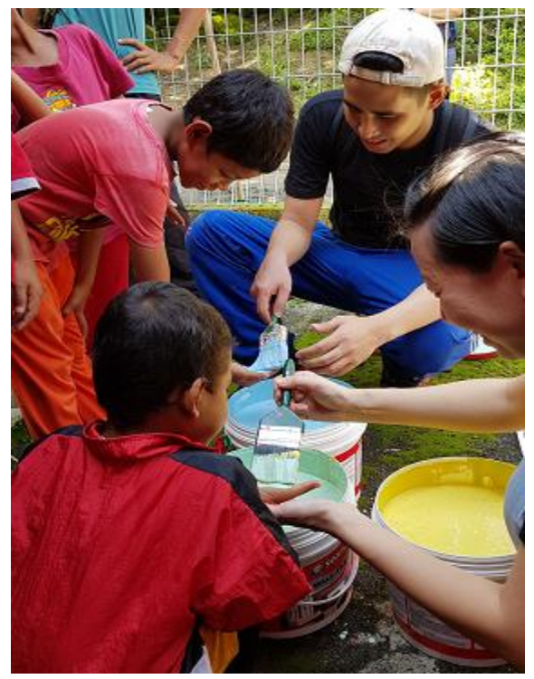
Orang Asli children joined us by putting paint on their palm