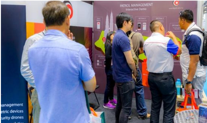
BigAnt's booth was seen filled with curious minds

Throughout the event, BigEye Patrol managed to gain tremendous interest from various types of industries, in particular the security service and security equipment companies.