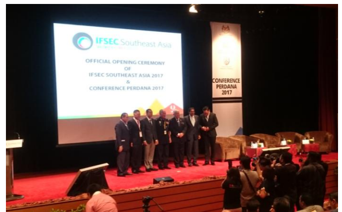
Opening ceremony in Plenary Theatre.

The event was graced by YAB Dato' Seri Ahmad Hamidi, Deputy Prime Minister of Malaysia and many visitors from near and far which includes neighbouring countries such as Thailand, Indonesia, Singapore, Vietnam, China, India, etc.