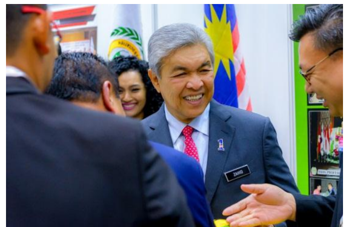
Tour around the exhibition by YAB Dato' Seri Dr. Ahmad Zahid Hamidi, Deputy Prime Minister of Malaysia.