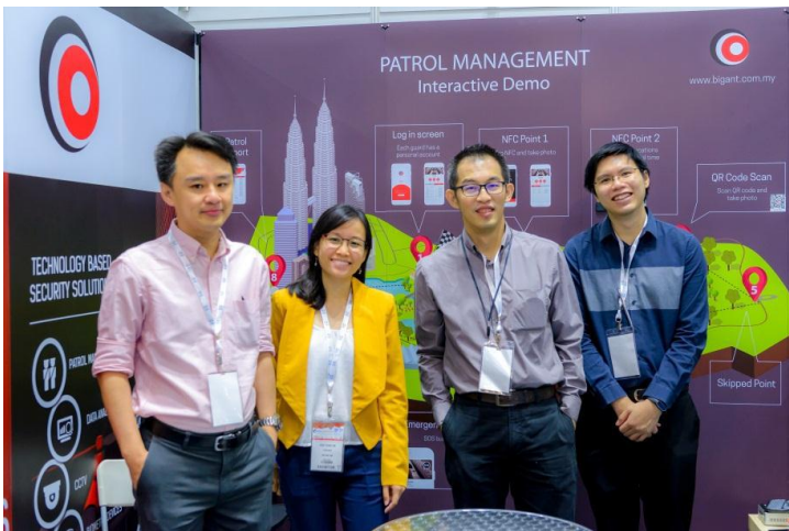
All smiles from the BigAnt team on the first day.