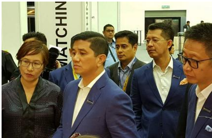
Dato' Seri Mohamed Azmin Ali with YB Elizabeth Wong Keat Ping (left) and Datuk Teng Chang Khim (right) walking through the exhibition hall

This exhibition was officiated by Y.A.B. Dato' Seri Mohamed Azmin Ali, the Honourable Menteri Besar of Selangor on 7 September 2017.