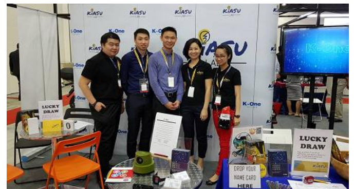
Supporting team representing K-One and KiasuLab