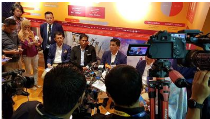
Press conference at Invest Selangor's pavilion

Technology giants such as Google, Nvidia, Alibaba and Tencent took part in the Future Commerce Forum to discuss digital issues and online marketing. Another highlight of the event was the 48-hour smart city hackathons which claimed to be one of South East Asia's biggest hackathons ever.