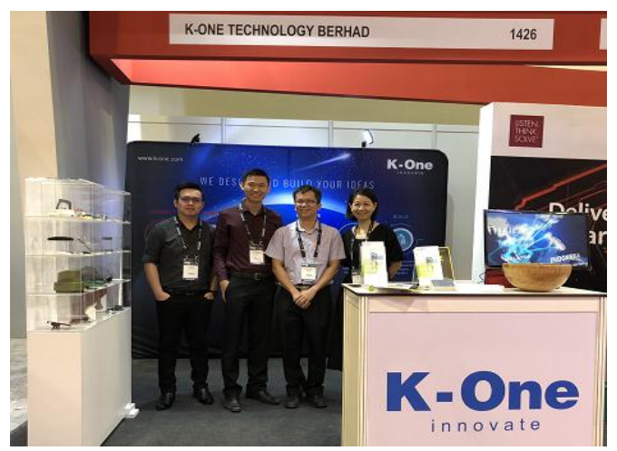
K-One staff standing in attention and getting ready for visitors.

The three-day event featured three themed pavilions, five global pavilions, inspiring keynote presentations and a host of technology forums to address key issues in the electronics manufacturing supply chain. Other event highlights included business-matching sessions, technical forums, workshops and seminars.