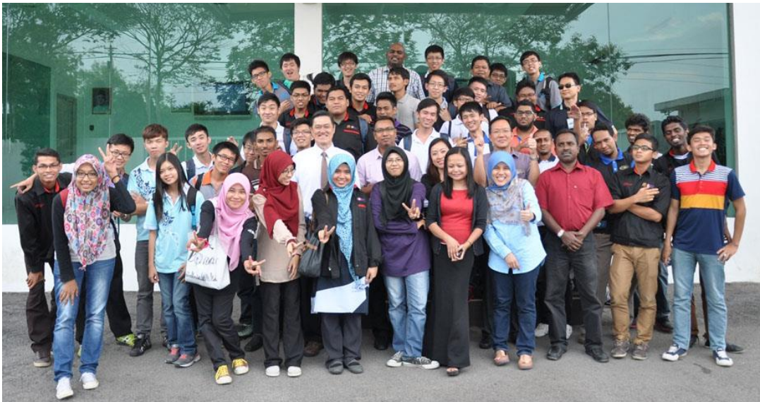
Cheers to a fruitful visit