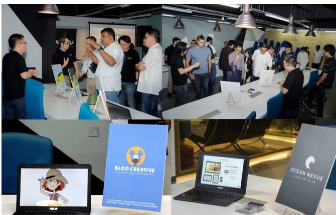
K-One and KiasuLab members' showcase at hot desk area

Another highlight of the event was K-One and KiasuLab members' showcase. It was a great opportunity to show technology products which were successfully launched to inspire emerging entrepreneurs and startups alike.