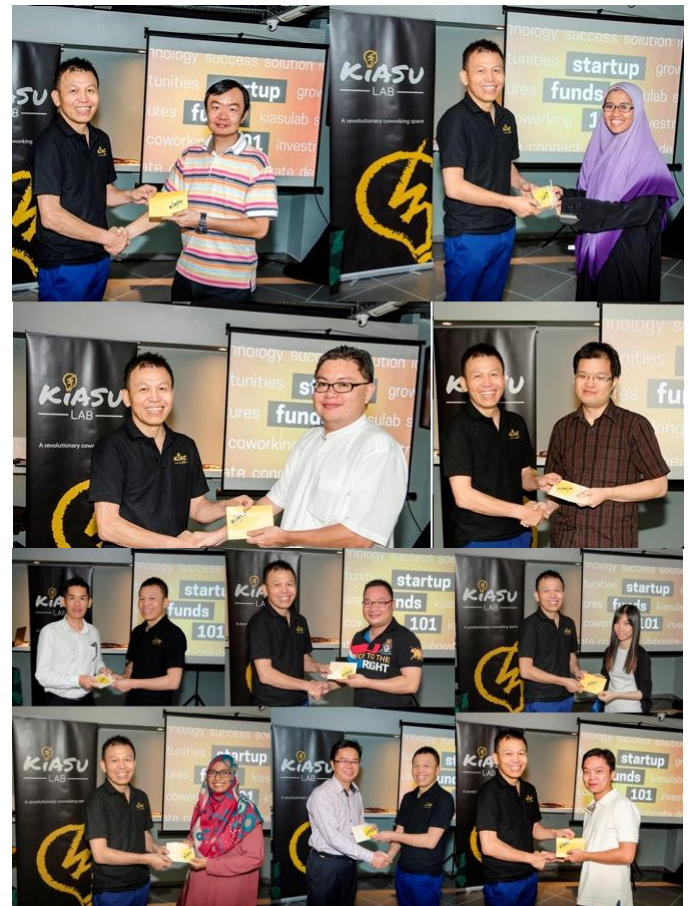
Lucky draw winners!!

The finale of the event was a lucky draw. There were 10 lucky startups who won attractive prizes to mark their wonderful moments at KiasuLab.