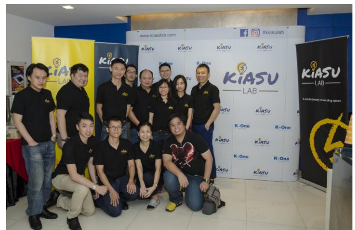
Open Day KiasuLab Team