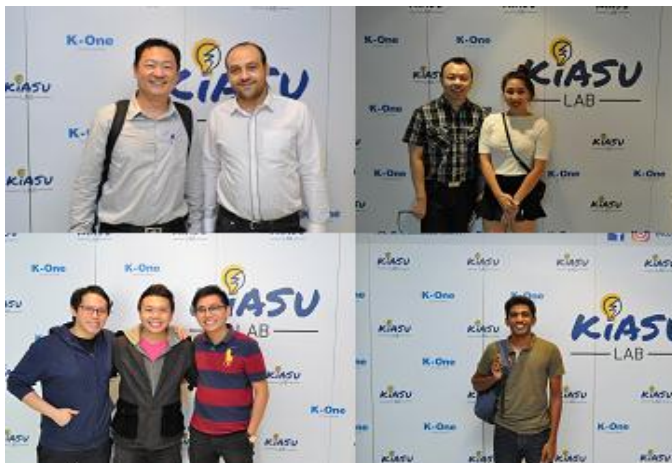
Enthusiastic participants before start of event