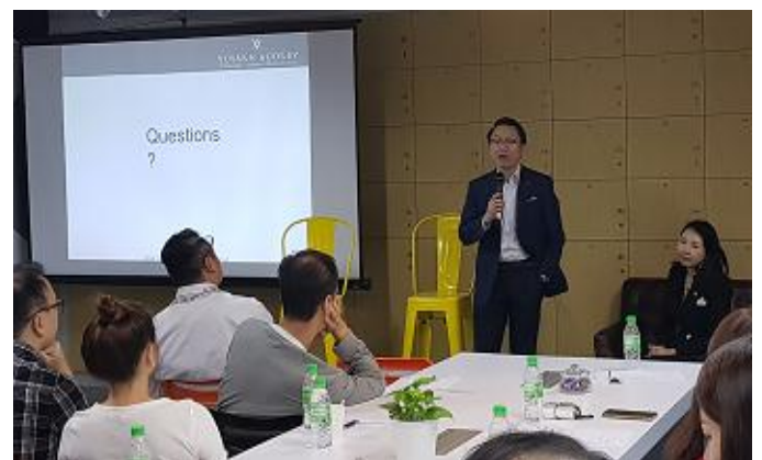
Q&A session with participants