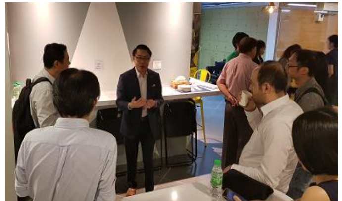
Networking session after the event