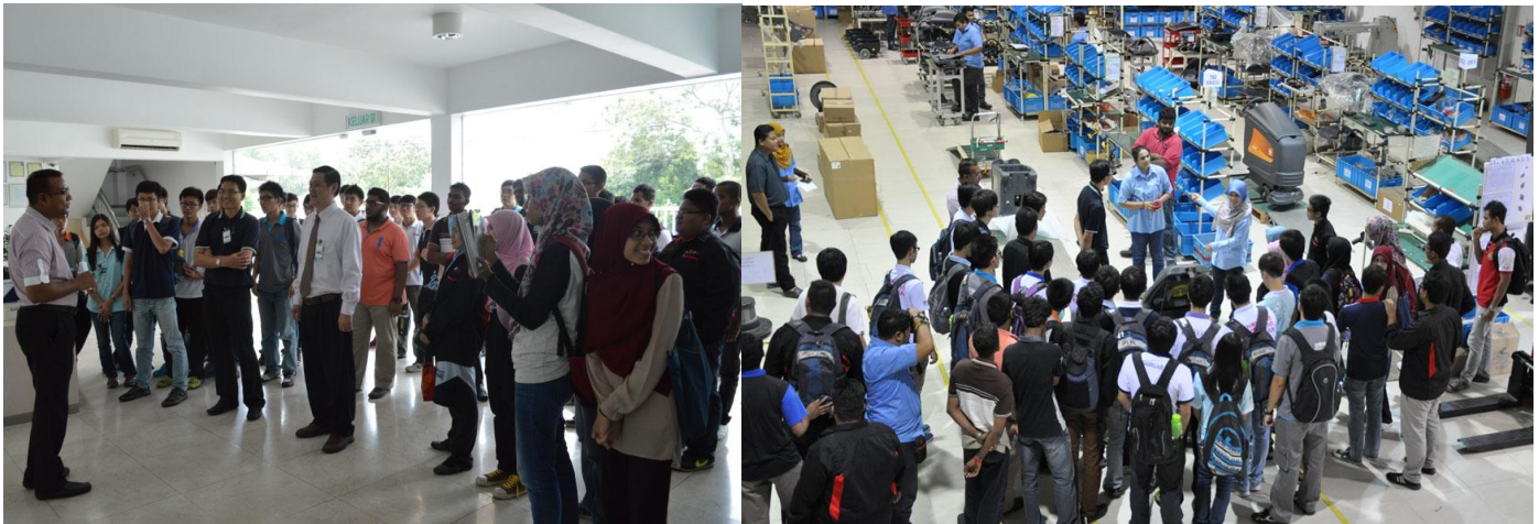
Briefing by our engineering and production staff