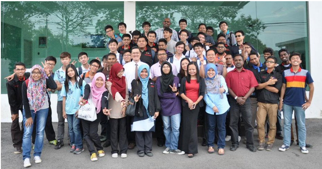
Cheers to a fruitful visit