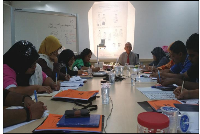
First Aid cum CPR training for staff at the Ipoh factory

Staff were taught First Aid basics such as emergency care for wounds and bleeding, fractures and dislocations, poisoning, burns and practical lessons on CPR.