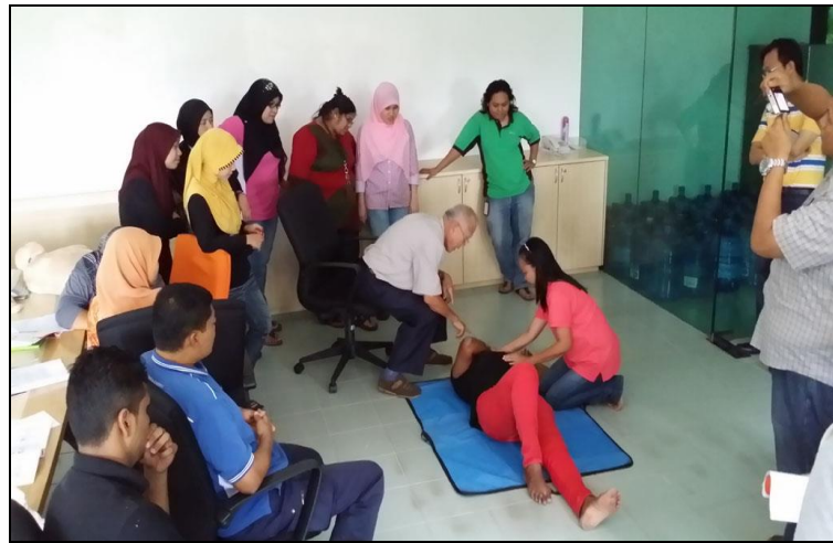
Staff getting practical life savings tips

As a Group that advocate principles of good health and safety practice, the recent 'Health Talk and Practice' sessions has helped encouraged the staff to be competent in health and safety matters. Investments in First Aid training will certainly go a long way to equip staff to be prepared at all times and have the knowledge to respond effectively in emergency situations.