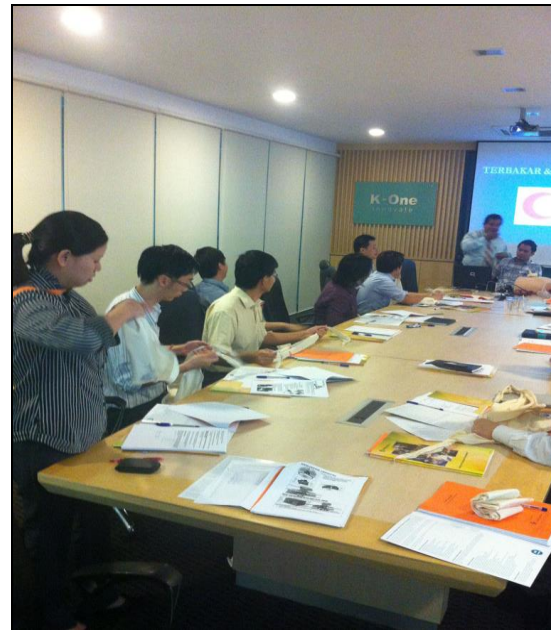
First Aid cum CPR training for staff at the Petaling Jaya Headquarters