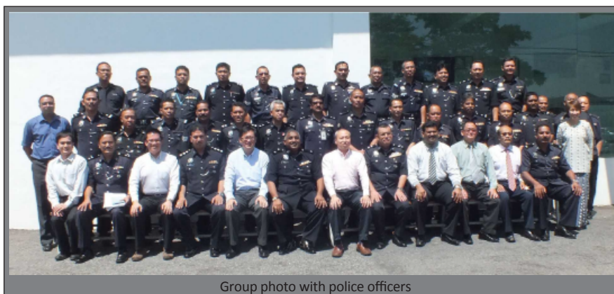
Group photo with police officers